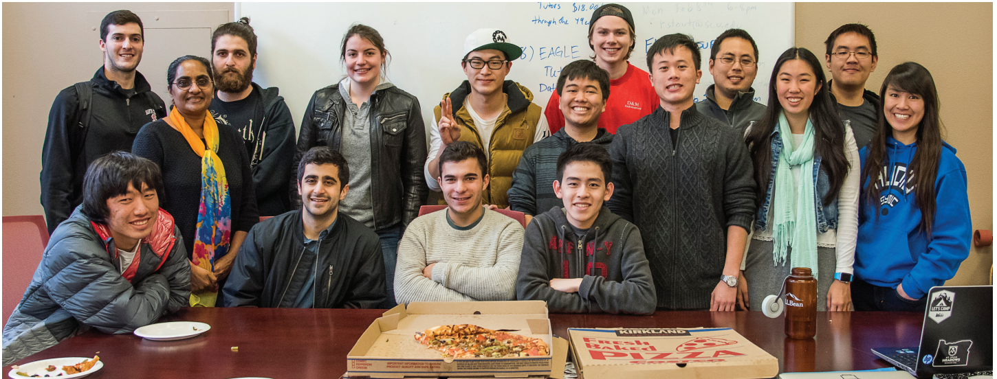
At a recent meeting, SCU's IEEE student chapter enjoyed pizza and planning a law career panel discussion, tutoring opportunities at a local elementary school, hosting a soldering workshop, and a field trip to Flex, a world leader in designing and building intelligent products.